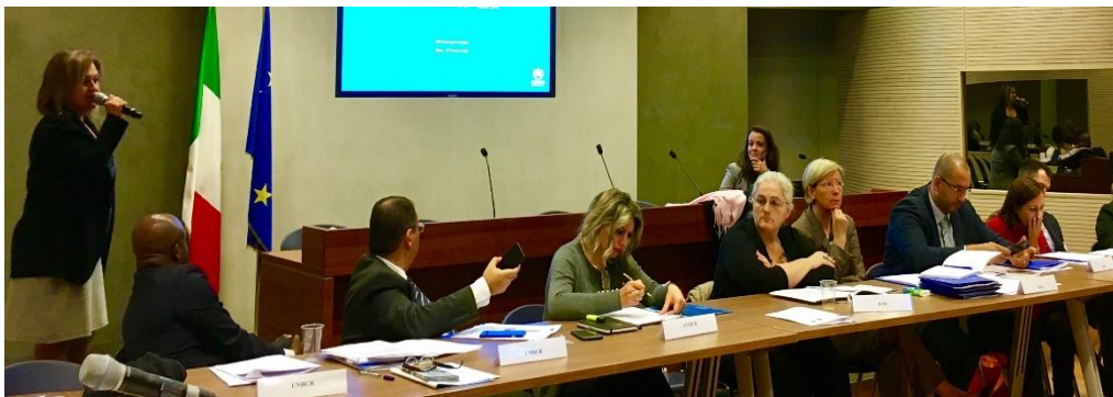
5 th RDPP NA Steering Committee at the Italian Ministry of Interior. Rome.

IOM assisted the Italian Ministry of Interior with the organization of the 5 th Regional Development and Protection Programme for North Africa (RDPP NA) Steering Committee . The RDPP NA Consortium, which consists of 15 EU Member States, the European Commission and other implementing partners (IOM, UNHCR and Save the Children) took part in the meeting. The event presented the main results achieved during the first year of the RDPP NA project implementation, and the priority actions, objectives, expected results and activities of the new 2016 RDPP NA Programme.