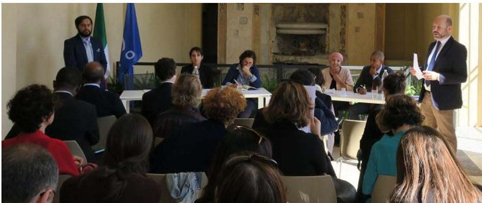
Presentation of CoNNGI at IOM in Rome.

The “Coordinamento Nazionale Nuove Generazioni Italiane – CoNNGI” celebrated its establishment at the IOM Office in Rome. CoNNGI represents many Italian associations created by young Italians with a migration background, who proudly embrace their transnational identities and values. CoNNGI started its activities in 2014, thanks to a call issued by the Ministry of Social Affairs and Labour, to ensure that new generations could participate in decision-making processes that concern them, such as inclusion and participation policy. CoNNGI seeks to create and consolidate collaboration with institutions and other organizations, to share experiences among associations and to represent them at national and international level.