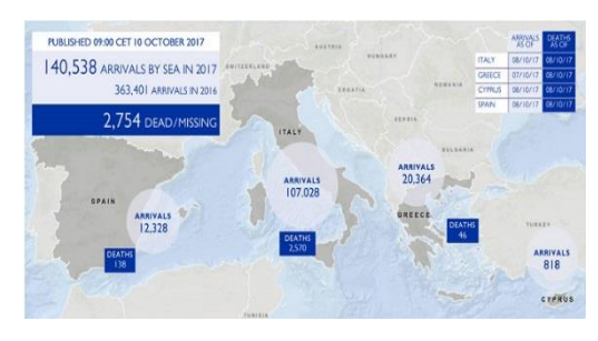
(as of 31 October)