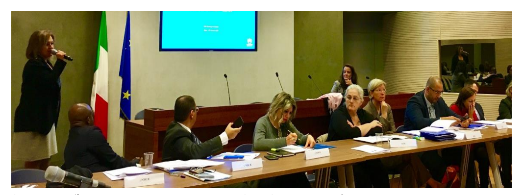
5<sup>th</sup> RDPP NA Steering Committee at the Italian Ministry of Interior. Rome.

IOM assisted the Italian Ministry of Interior with the organization of the 5<sup>th</sup> Regional Development and Protection Programme for North Africa (RDPP NA) Steering Committee. The RDPP NA Consortium, which consists of 15 EU Member States, the European Commission and other implementing partners (IOM, UNHCR and Save the Children) took part in the meeting. The event presented the main results achieved during the first year of the RDPP NA project implementation, and the priority actions, objectives, expected results and activities of the new 2016 RDPP NA Programme.